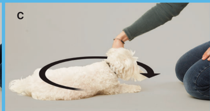
4. Do the “roll over”.

A ) Start with your dog in the down/stay position, and hold a treat or toy near the nose as a lure. In a clockwise circular motion, move the lure to the side of one shoulder, luring the head.