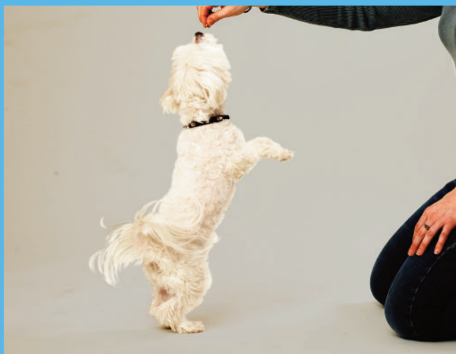
2. “Stretch up”, then “take a bow”.

Walking is an excellent, all-purpose warm-up prior to exercise, practice or competition. Start walking at a comfortable pace, then move into a trot for 5-10 minutes. To build endurance, we recommend 20 minutes or more of moderate intensity exercise such as trotting or swimming.