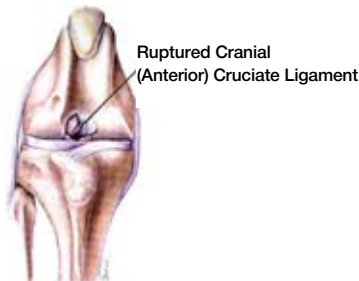
Picture of the knee as seen from the front with location of Cruciate Ligaments